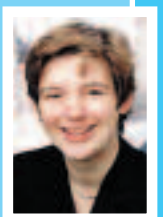
Ruth Kelly, Secretary of State for Communities and Local Government

On 7th February 2007 the UK's Communities Secretary, Ruth Kelly, unveiled a new international challenge for housebuilders to design and build flagship zero-carbon and low carbon communities.