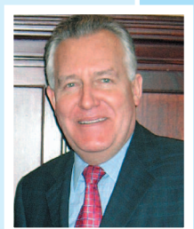
Rt. Hon. Peter Hain MP, Secretary of State for Work and Pensions

The UK construction industry has an annual turnover of £250 billion pounds, which is 8% of UK GDP. It employs about 10% of the working population, making it the country's biggest industry. It is a key industry in the delivery of London's 2012 Olympic Games and in the Prime Ministers plans for 3 million new homes by 2020.