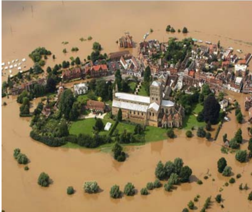
Tewkesbury, July 2007