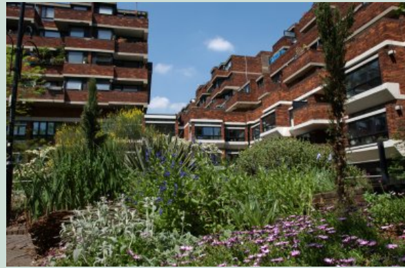
Lillington & Longmoore