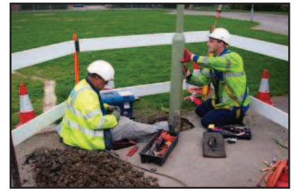
SEC street lighting engineers working to repair column.

development requirements, make more efficient use of resources within the Partnership and we have improved budget predictability.