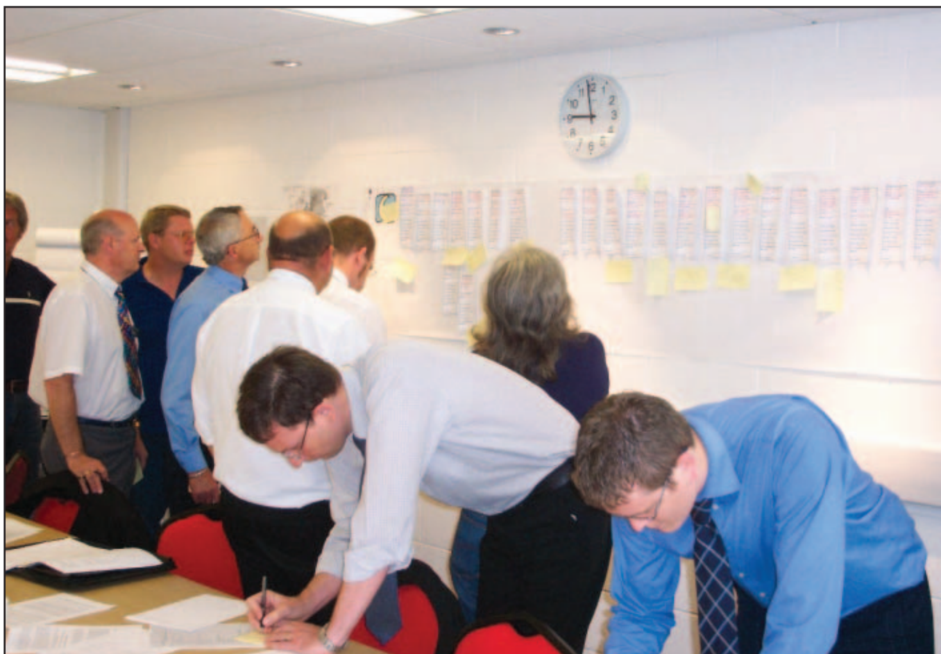
Processing Mapping Raynsway Project.

SEC had three specialist teams visiting the same site at different times. This meant they were making up to 10 visits to replace a street lighting column, leaving the street light out of order for almost a month. It also meant potentially digging up the same area of pavement on up to four different occasions.